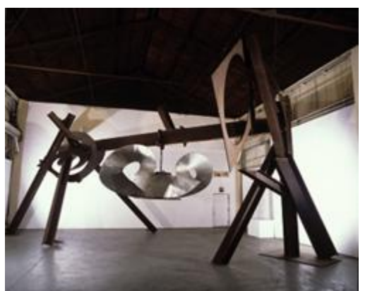
Beethoven's Quartet, 2003. Steel and stainless steel, spacetime c.c.

Mark di Suvero: The end result of any work is the result of the methods. At a symposium in Toronto in '67. it came to me that I needed a set of tools essentially the crane, the cherry-picker (they call it the "man-lift" sometimes), a torch, a welder, accessory hammers, wire brushes, and small hand tools. The crane allows for lifting. As Renzo Piano said to me two days ago, "Well, Mark just picks 'em all up and moves them around with a crane, and then when he likes it, he just welds it, and turns it over sometimes." Renzo got it completely. He's an architect, but he's a builder also. Architects sometimes ignore the building process itself. They haven't been trained in it. Renzo has.