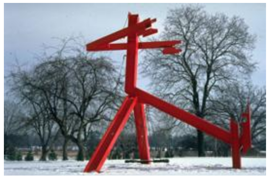
La Petite Clef, 1972–73. Steel and wood, 8 x 8.23 x 11.51 meters. © George Bellamy. Courtesy of the artist and spacetime c.c.

JGC: Another motion-filled work is Beethoven's Quartet, which has a suspended, moving core. How did you develop the central shape? Could you