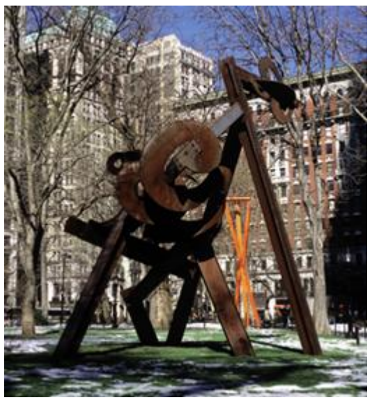
Beyond, 2004. Steel, 7.3 x 6.5 x 6 meters.

JGC: Does the title drive the work or emerge later?