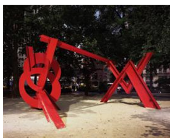
Aesope's Fables, 1990. Steel, 3.52 x 9.9 x 4.2 meters. © J. Price, Courtesy of the artist and spacetime c.c.

in SoHo. There was an effort, on the part of Dick, myself, and the people who worked with me, to build a gallery that did not depend on competition, publicity, and the art market.