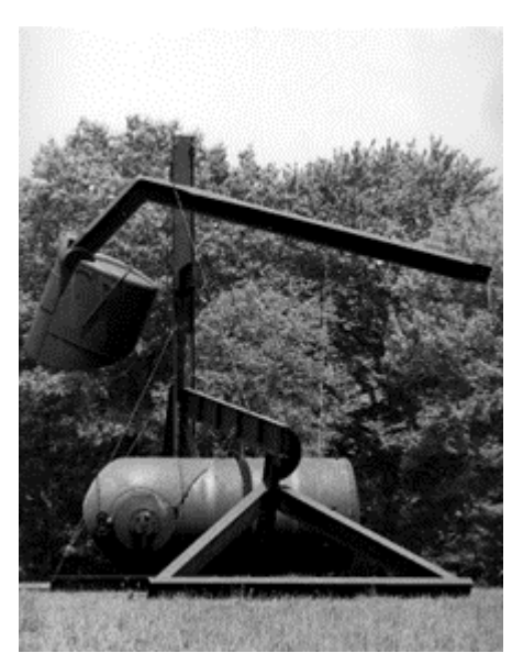
Yes! For Lady Day, 1968–69. Painted steel, 16.46 x 12.19 x 10.67 meters. © George Bellamy. Courtesy of the artist and spacetime c.c.

What is so thrilling about sculpture is that we make these meanings real—that is, in three dimensions, so that you can bump into them in the dark. There is a way of looking at the objective world that is very analytical, that describes it and tests it. And then there is a way, as in sculpture, when you have the real object there, that is like a springboard into dreams, poetry, and the feeling—the internal feeling of one's life. More and more, we have a split in human minds between the feeling, internal, subjective world and the objective world where the car runs into somebody or into a wall. In contrast to the analytical, the subjective world is much more plastic and changes in ways that depend on meanings at a psychic level.