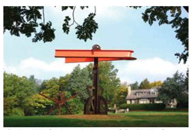
Destino, 2003. Steel, 5.5 x 9 x 3 meters.

I had left the United States because of the Vietnam War, after prison, demonstrations, stuff like that. This show happened just at the time that peace was declared. So I felt that I could return to the U.S., and that's when I did the all-city show at the Whitney.