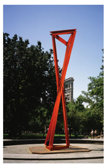
Double Tetrahedron, 2004. Steel, 17 x 4 x 4 meters.

JGC: Let's go back even further to your first exhibitions at the March Gallery, the Green Gallery, and Park Place and to your early friendships, including Dick Bellamy.